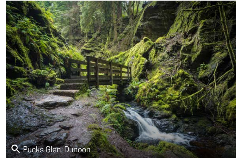
🔍 Pucks Glen, Dunoon

promotions, and events were delivered. Membership included representatives of the organisations on the Steering Group plus additional members as identified by the Steering or Working Group: ASVA; CalMac; Crown Estates; Cruise Scotland; Festivals Edinburgh; Forestry Land Scotland; Interface; Keep Scotland Beautiful; Loch Lomond & The Trossachs National Park; Marine Conservation Society; Marine Scotland; Northern Lighthouse Board; Paths for All; RNLI; Royal Navy; RSPB Scotland; Scotland Food and Drink; Seafood Scotland; Society of Antiquaries of Scotland; The Helix/Falkirk Community Trust; West Coast Marine Tourism; Wild Scotland; Loch Lomond & The Trossachs National Park.