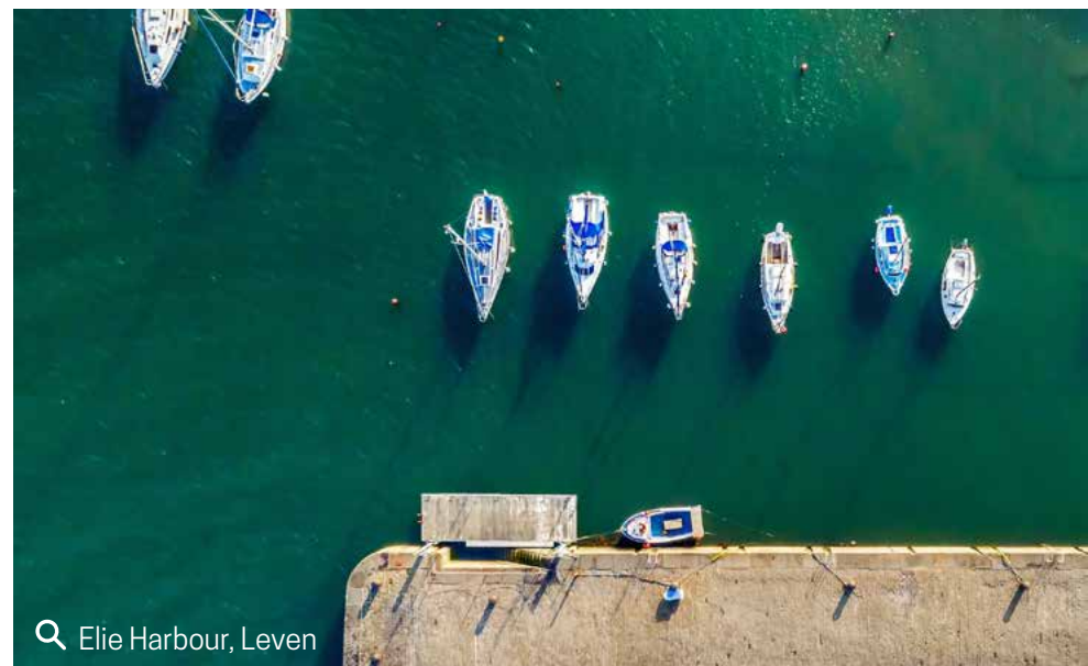
Elie Harbour, Leven