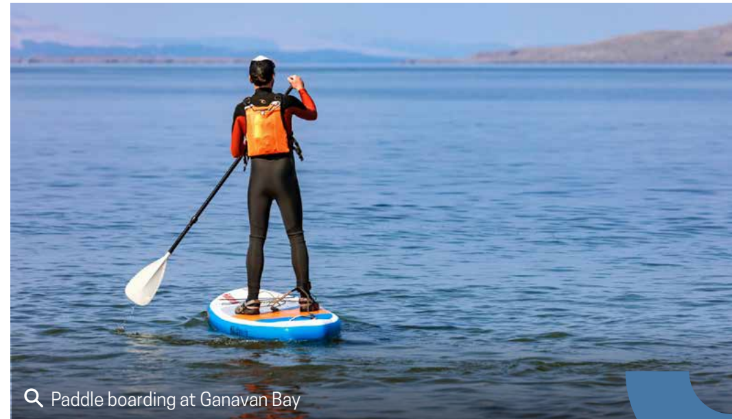
🔍 Paddle boarding at Ganavan Bay

“The support we received at the start of the Themed Year was a great grounding for our planning: attending the workshop at the National Museum of Scotland and the Scottish Parliament reception helped us to make long-lasting connections that continued throughout the project... And the further support during the pandemic offered through the Themed Years was also helpful and clarifying. I attended the Themed Year workshop online and listening to the experience of others, I felt very emotional about the fact that we weren’t alone. We of course were in close contact with the EventScotland team, but to hear from others in similar positions who had perhaps gone through so much to make their project happen or had taken a difficult decision not to continue, it was so useful.”