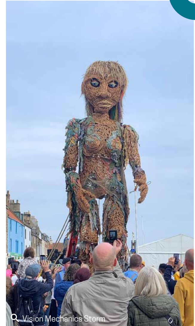
Q Vision Mechanics Storm

In addition to the funding opportunities provided by the YCW core budget, a range of additional and aligned funding opportunities were established to support the creation of a rich, celebratory YCW programme.