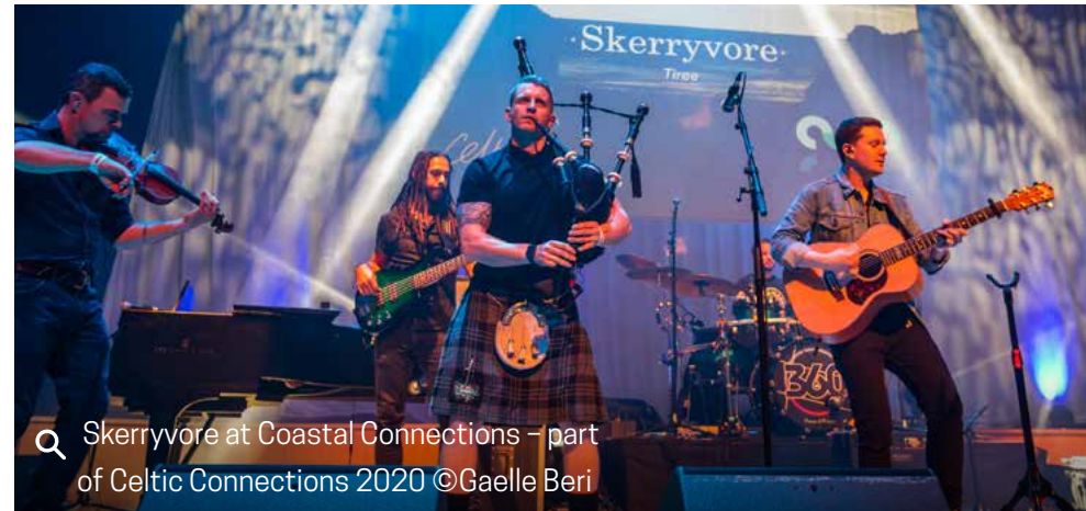
Skerryvore at Coastal Connections – part of Celtic Connections 2020

However, given the significant momentum and engagement gained in the planning, promotion, and early delivery stages of the project, the decision was made to roll YCW into and across 2021. This allowed partners to continue to work together and support each other through a global pandemic and (despite many challenges and delays) deliver impressive results. The project exceeded many of its pre-pandemic objectives and targets and delivered activity in communities across all 32 Local Authorities.