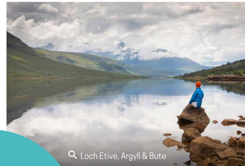
🔍 Loch Etive, Argyll & Bute