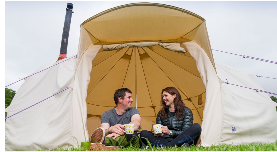
Glamping at Portnellan Farm

Any other organisations that aspire to develop agritourism in Scotland.