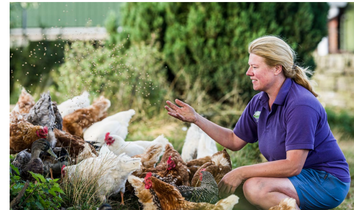
Newton Farm Holidays