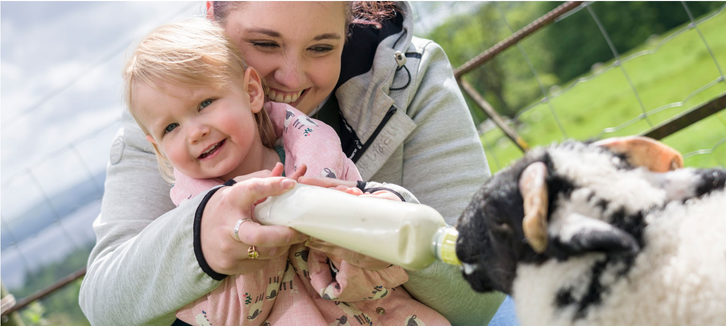
Feeding lambs, Lennox of Lomond Farm Tours

An action plan to support delivery of this strategy is nearing completion. The next step is to prioritise these actions and identify the lead supporting partners with specific responsibility for delivery of each action.