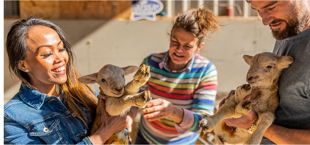
Boutique Farm Bothies

To build financially sustainable, profitable, and resilient businesses and to play a key role in sustaining the future of Scottish agriculture.