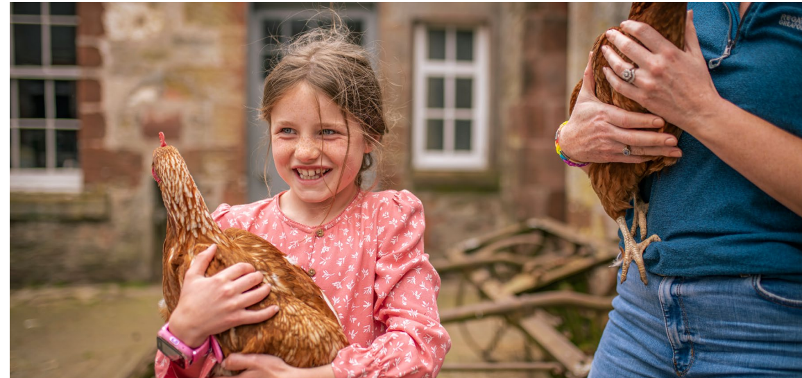
Old Leckie Farm

Investment in the Go Rural brand to grow sector awareness with consumers.