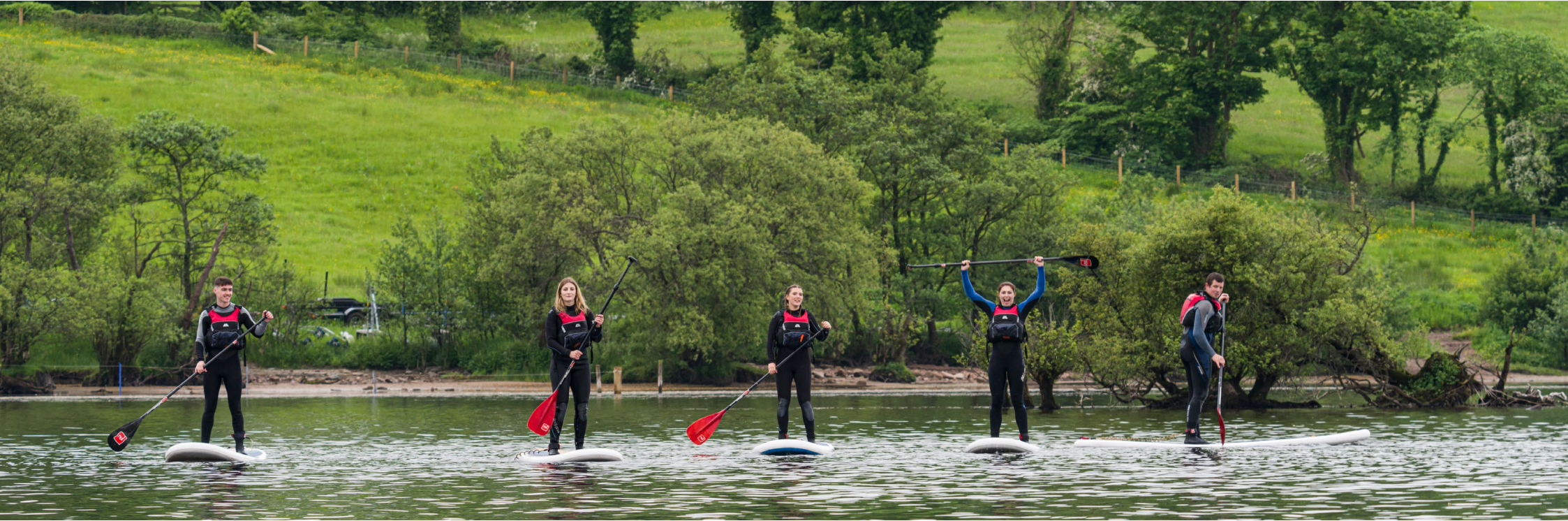
Paddleboarding at Portnellan Farm