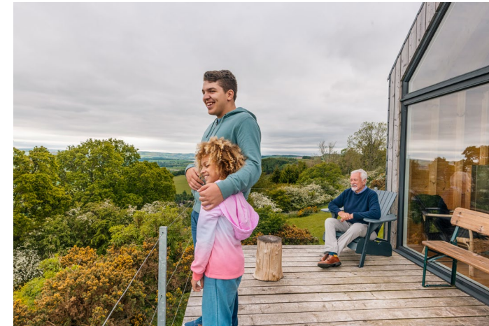
The Infield, Guardswell Farm