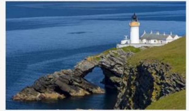
📍 The lighthouse on Bressay, in Shetland. The island is also noted for its archaeological sites. The Highlands – people and their passions Scotland's Highlands and islands are renowned for their natural beauty, rich

Guidebooks and travel blogs will get you so far, but there's nothing quite like being told by a local to visit an ancient tomb or a hidden first world war relic this autumn and winter